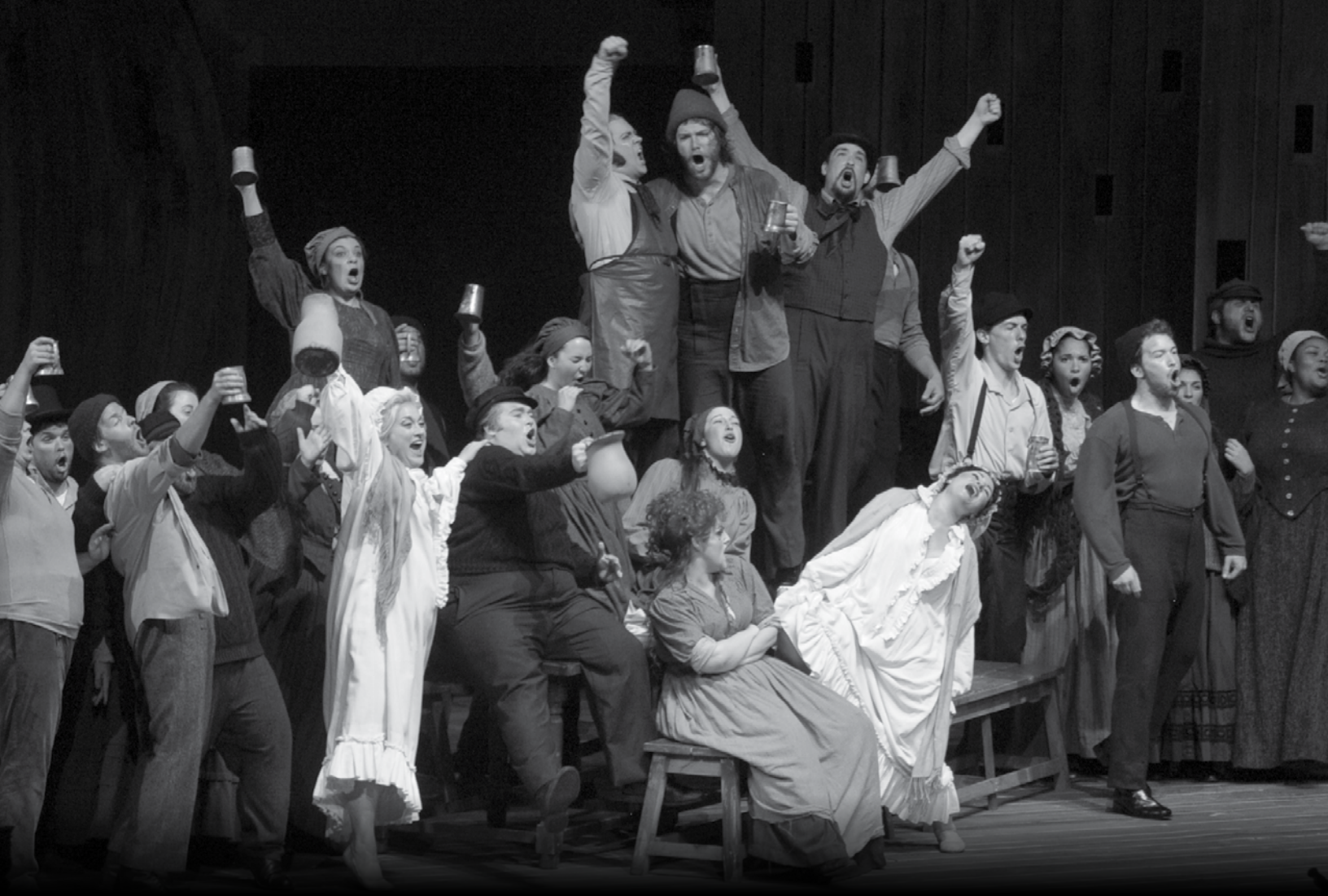
Peter Grimes, Part I, Scene 3, "The Boar"