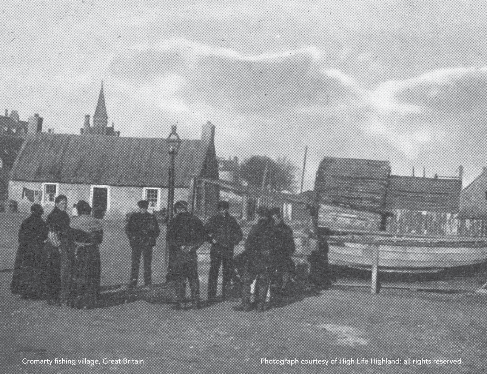
Cromarty fishing village, Great Britain