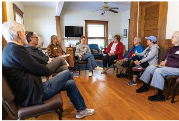
CHQ Dialogue participants discuss the theme and lectures from the week in small group, facilitated gatherings.

Leadership responsibilities are shared by members of the community with years of experience in facilitating dialogues. They work during the summer season and as needed the rest of the year to help ensure you have opportunities for great dialogues.